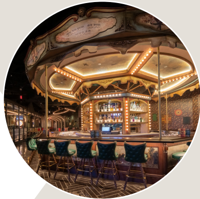
4. LAS VEGAS, NV