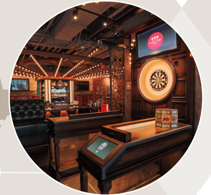
2. BOSTON, MA