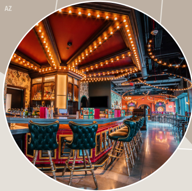
3. HOUSTON, TX