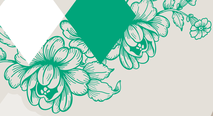
6. DENVER, CO