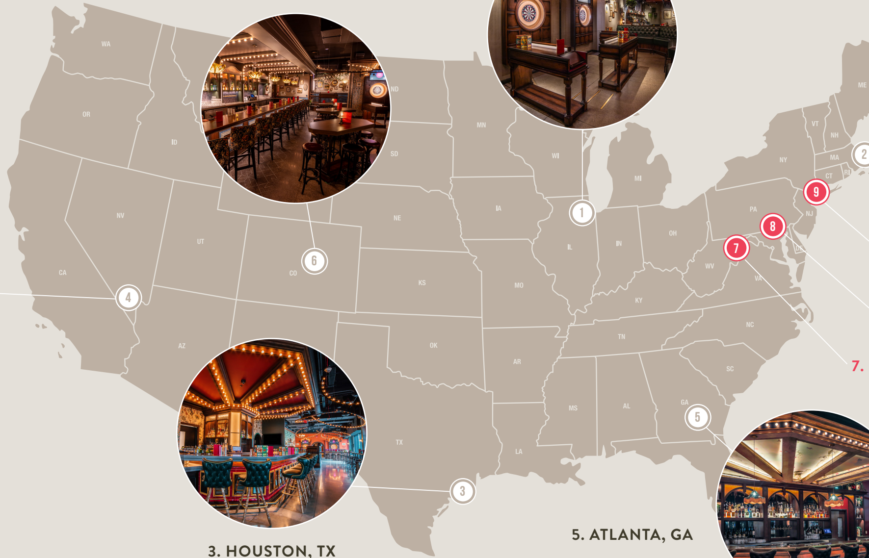
7. PHILADELPHIA, PA (coming soon)