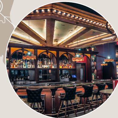
5. ATLANTA, GA