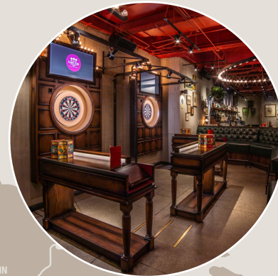
1. CHICAGO, IL