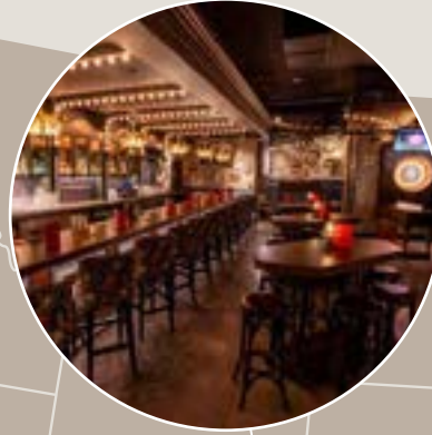
3. HOUSTON, TX