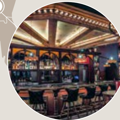
5. ATLANTA, GA