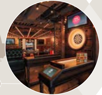
2. BOSTON, MA